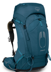
♂ ATMOS AG 50