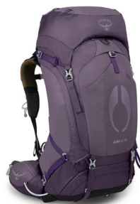
♀ AURA AG 50