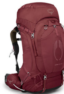
AURA AG 65

Welcome to Osprey. We pride ourselves on creating the most functional, durable and innovative carrying product for your adventures. Please refer to this owner's manual for information on product features, use, maintenance, customer service and warranty.