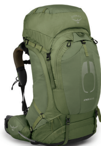
ATMOS AG 65